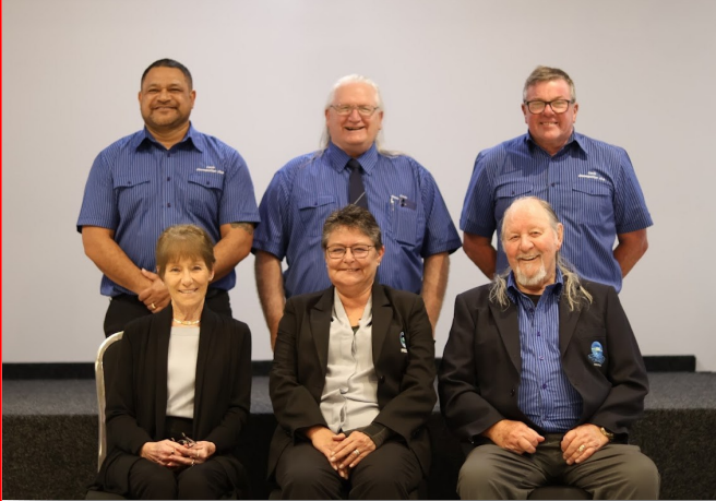
General Manager, Club Executive & Patron