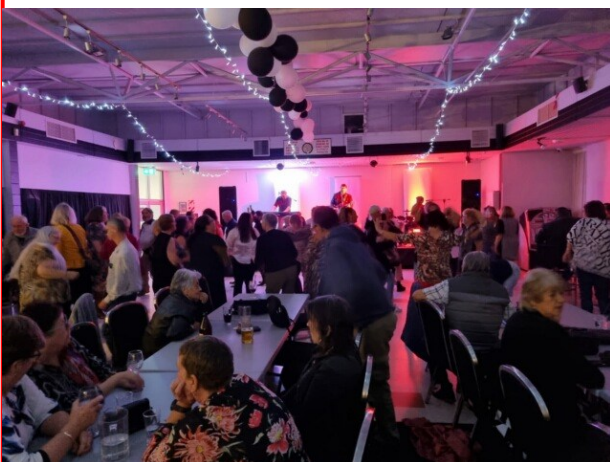
Harmony Showdown Band