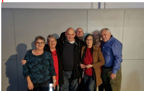
Past Staff Members