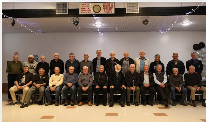
Our 50 years plus Members