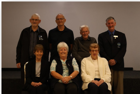
Our Life Members